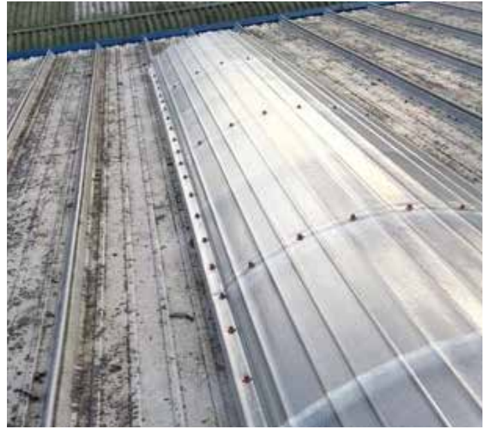
New Zenon Arc rooflights

The refurbishment project included Zenon Arc; the modular GRP barrel vaulted The rooflight system. A 1200mm daylight opening with 8 runs of 60.4 metres was required.