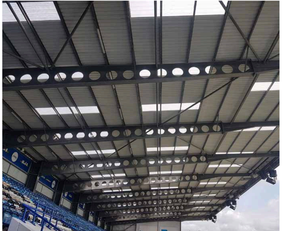
New Zenon Pro rooflights at the Fratton End

Zenon Pro rooflight sheets are suitable for installing as single skin assemblies as well as double skin. They comply with CE marking, meet non-fragility requirements and they offer high levels of natural daylight.